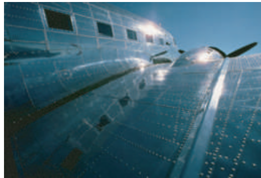
Riveted Finish for Exterior Surfaces