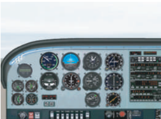
Cockpit Dials embedded in counter-top