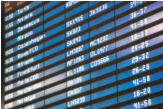
Split-Flap Display Systems for Menu