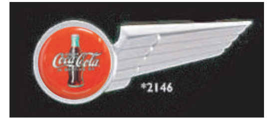
A new Coke property for the chosen brand name that reflects the airline inspirations

Staff Uniforms that carry forward the airline theme, dressed as Coke stewards / hostesses, and details like airline pins and patches.