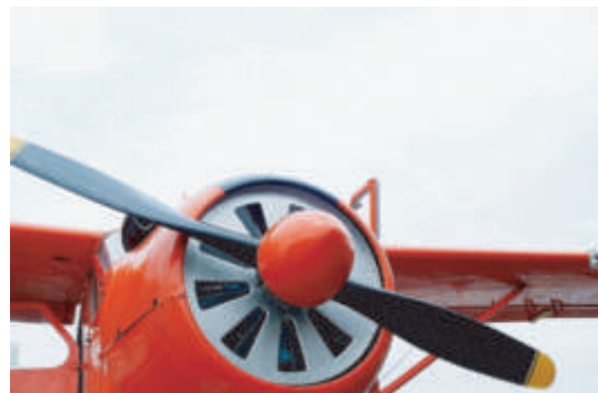
Propeller embedded inside front facade